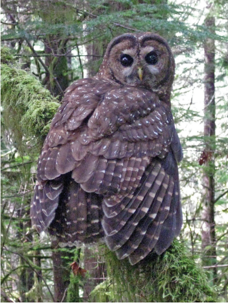
Northern spotted owl.

Wahl et al. 2006). They nest in cavities or platforms, and nesting begins in late March or April, with juveniles dispersing in September to October. Northern spotted owls are mature forest specialists, feeding primarily on flying squirrels and woodrats (Marshall et al. 2006). The spotted owls have suffered a significant decline in recent decades, likely driven by competition from the closely related barred owl and loss of old forest habitats. (USFWS 2016). Northern spotted owls are protected by the federal Endangered Species Act, by the Oregon Forest Practices Act, and by Washington State Forest Practices Rules. The species is on Oregon's Sensitive Species List and a priority species in the Oregon Conservation Strategy (ODFW 2006, 2016 revision pending approval).