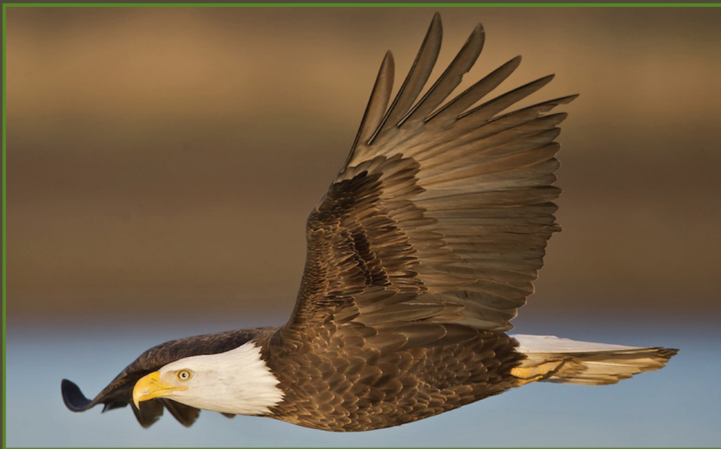
Bald Eagle.

Oregon and Washington are home to a variety of raptor species, across all habitat types and geographic ranges. This publication focuses on raptor species that inhabit forested areas. These species can be categorized by forest habitat type association. Table 1 lists raptors commonly associated with forested areas of Oregon and Washington. Following the table, each of these species will be discussed in further detail.