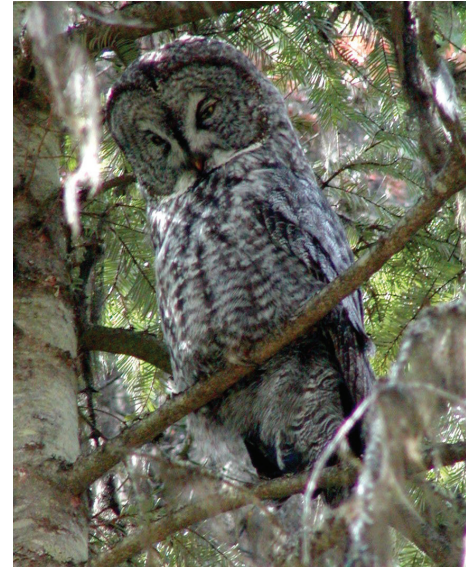
Great gray owl.

Great gray owls are enormous grayish owls and their large head has a distinctive facial disc. They are associated with mature and old-growth coniferous forests, almost always near openings (such as meadows or clearcuts) (Marshall et al. 2006). In Washington, great gray owls are rare in the north central and southeast portions of the state (Wahl et al. 2006). In Oregon, they are also uncommon, occurring in the south-central and northeastern portions of the state. Great grey owls nest in broken top trees, mistletoe clumps, and platform stick nests made by squirrels and hawks. They are also known to use artificial nest platforms. Breeding begins in late February, with eggs laid at the beginning of March. Juveniles fledge from the nest from mid-May to mid-June and may disperse up to three months following fledgling. Diet of the great gray owl includes pocket gophers, voles and other small mammals (Marshall et al. 2006). The species is on Oregon's Sensitive Species List and a priority species in