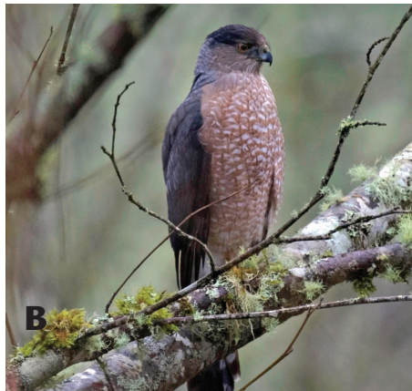
Coopers Hawk (A), Sharp-shinned hawk (B), Great Horned Owl (C)