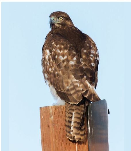
Juvenile red tailed hawk.

Sharp-shinned hawks are the smallest of the Accipiters, and can be found in a variety of forest types. Nesting habitats are generally characterized by dense canopy