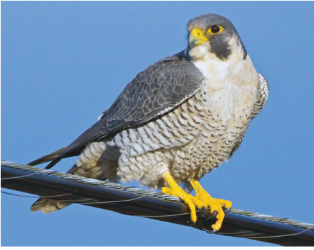
Peregrine falcon.