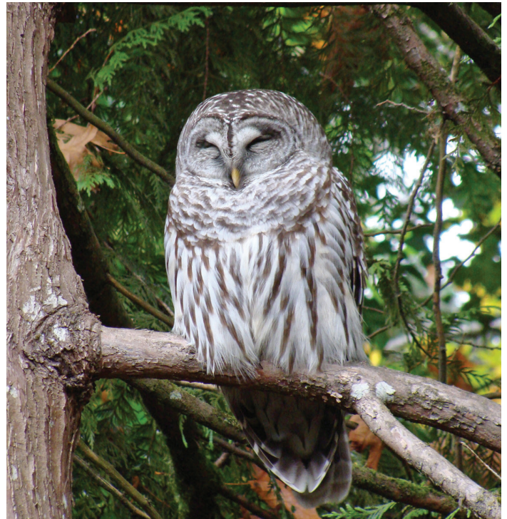
Barred Owl.

U.S. Fish and Wildlife Service Guidelines for Raptor Conservation in the Western United States: http://www.blm.gov/pgdata/etc/medialib/blm/ut/lands_and_minerals/oil_and_gas/february_20120.Par.52166.File.dat/FWSRaptorGuidelines.pdf