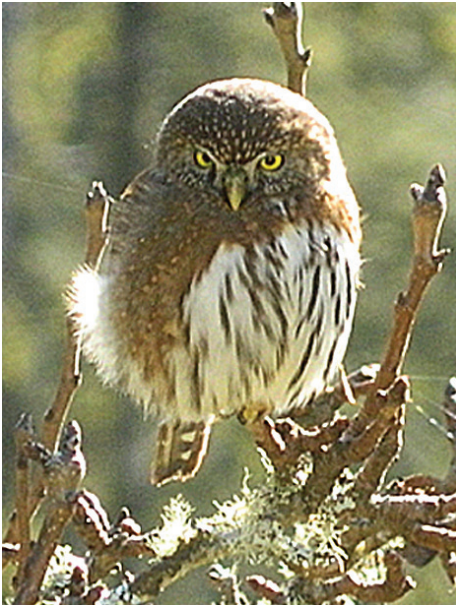
Northern pygmy owl.

They feed upon a large variety of prey, including small and medium-sized mammals, other owls, waterfowl, small birds, snakes, and insects. Prey items may include rabbits, mice, voles, woodrats, and mountain beavers. Great horned owls typically nest in unused red-tailed hawk nests in the crooks of medium to large sized trees, in the tops of broken off trees, artificial platforms, but will also nest on rocky ledges or even on the ground. Nesting begins in late winter, January or February, and juveniles disperse in September (Marshall et al. 2006). They are fierce predators, and have been known to take skunks and house cats.