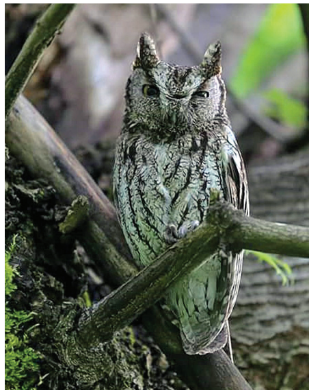
Western screech owl.

Western screech owls inhabit forest edges and riparian woodlands. Preferred habitats are located near pastures or fields and contain large trees. Western screech owls are fairly common year-round residents throughout suitable habitats (Marshall et al. 2006, Wahl et al. 2006). These small owls sport distinctive tufts similar to the much larger great horned owl. Western screech owls nest in cavities, will use artificial nest boxes, and are known to use human structures with a suitable cavity. Breeding begins in January or February and juveniles typically fledge in June to July, but sometimes extend into August. The diet of the western screech owl is diverse, with prey items including voles, mice, frogs, crayfish, small fish, small songbirds and insects (Marshall et al. 2006).