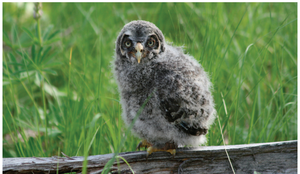
Juvenile great gray owl.