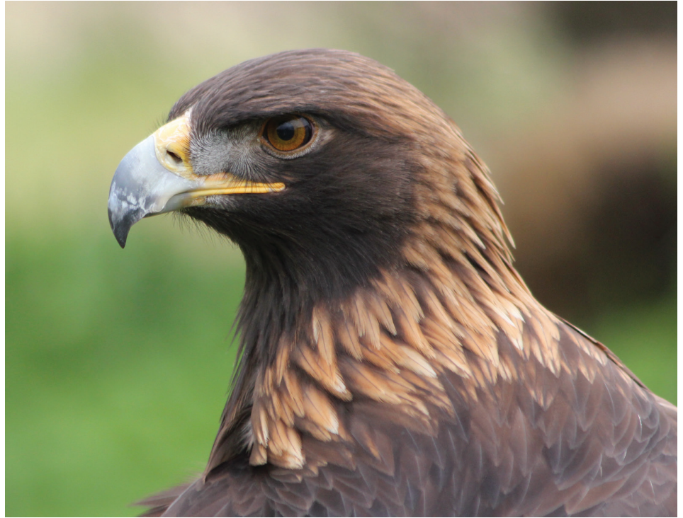
Golden Eagle.

Bald eagles are large eagles with distinctive white heads that will inhabit any forested area with large trees adjacent