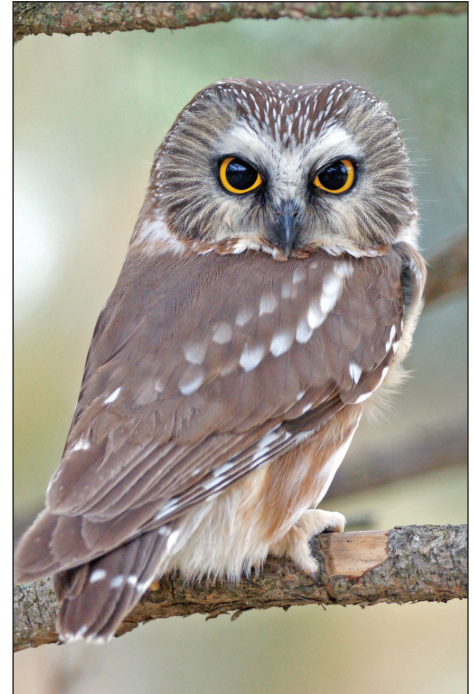
Northern saw-whet owl.

Northern saw-whet owls are considered one of the most common owl species and can be found in coniferous, mixed, and occasionally riparian forests at low-elevations (Marshall et al. 2006, Wahl et al. 2006). They nest in cavities, natural or created by woodpeckers, and will also use nest boxes. Nesting generally begins in April, and dispersal is thought to occur in September. Northern saw-whet owls are small and have distinctive white “v” shaped markings