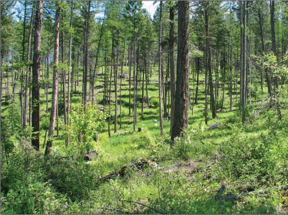
Open forest.

As cavity nesters, western screech owls depend upon snags for nesting substrates. Maintaining or creating snags will benefit the western screech owl and other cavity nesting species (Cornell University 2015, USFWS 2008).