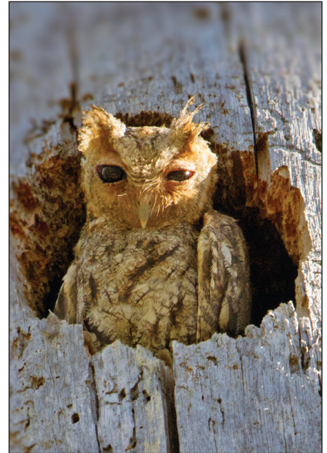
Flammulated Owl.

The preservation of mature forests with dense canopy covers will benefit the barred owl, northern spotted owl, great gray owl and northern goshawk. Retention of downed wood and snags will support the species by providing nesting