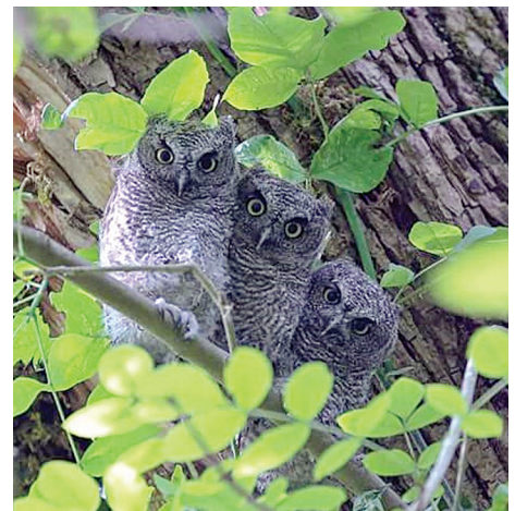
Juvenile screech owls.